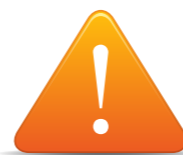
Waste and Hazardous Material Management